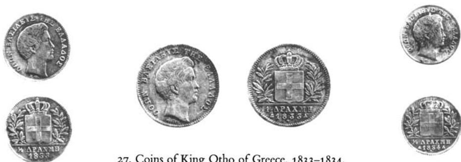
27. Coins of King Otho of Greece, 1833–1834.

After the assassination of Capodistrias in 1831, the great powers of Europe chose the 17-year-old Otho, Prince of Bavaria, as first King of Greece (1832–