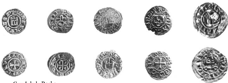
Guy I de la Roche

The first of the Frankish lords of Athens was Othon de la Roche (1204–1225), a Burgundian nobleman. Under Othon and for about the first two