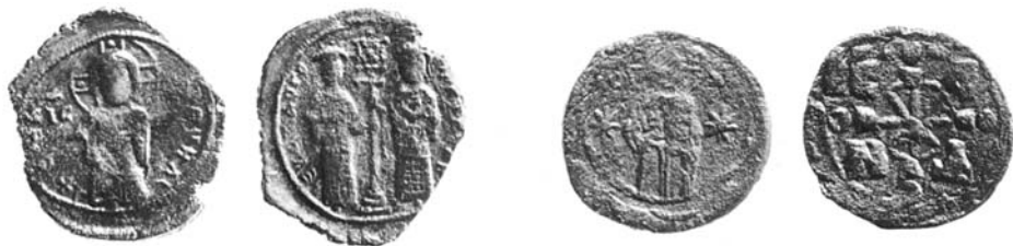
12. Folles of Constantine X and Eudoxia and of Nicephorus III.

DURING THE REIGN of John I a revolution took place in the design of Byzantine copper coins. A new type, the so-called 'anonymous' follis (11), was introduced and, with modifications, lasted about a century. The new follis derives its name from the fact that the name, titles, and portrait of the emperor were replaced by an image of Christ (and, in some instances, also the Virgin) and an inscription that makes no mention of the current ruler. The exact chronology of the 'anonymous' folles has been difficult to establish because of the absence of imperial names, but scholars are now in agreement as to the sequence of issues and their approximate date. Overstruck specimens excavated in the Agora have been of great value in ordering and dating the several series.