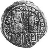
Leo VI and Alexander