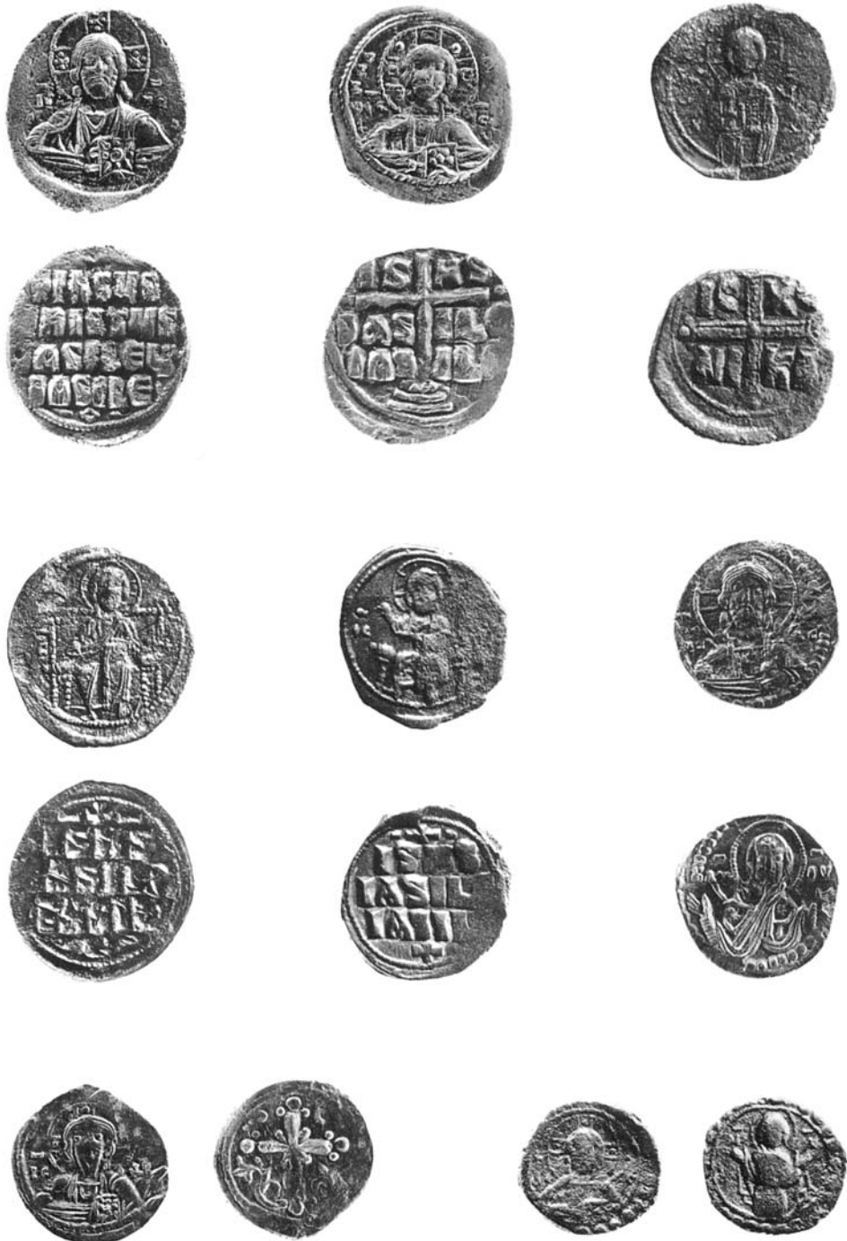
11. Anonymous Byzantine folles, 970-1092.