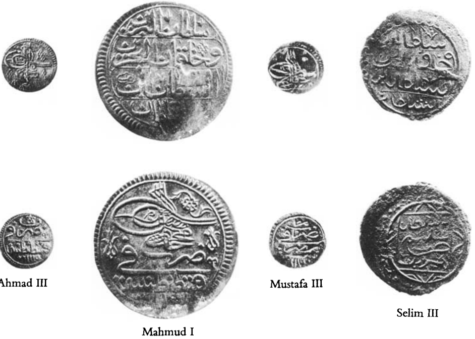
21. 18th-century Ottoman Turkish coins.

The Ottoman issues illustrated here include some rather crude early hammered bronze pieces of irregular shape and others produced by modern minting machinery, as well as several denominations of gold, silver, and copper coins. All the pieces share, however, a number of common features. The name of the current sultan is prominently spelled out in Arabic script, which is read from right to left. The coin type is frequently dominated by the tughra , the elaborate official signature of the ruler, as on all but one of the illustrated 18th- and 19th-century pieces (21, 22). The tughra contains the sultan's name, the title 'khan' (lord), the sultan's father's name, and the epithet 'al Muzaffer da'ma' (the ever victorious). The Ottoman coins, like their Byzantine predecessors in the Agora, are quite informative. They regularly bear the place of minting and, from the time of Mustafa III (1757–1774), the date of issue. The year of striking is determined by the combination of accession year and regnal year stamped on the coins. The dates are given according to the Muslim Era reckoned from the Flight (Hijra) of the prophet Muhammad from Mecca to Medina in A.D. 622. (Muslim years are lunar years. To convert Hijra dates to common-era dates, 97% of the Hijra date is added to 622.) The