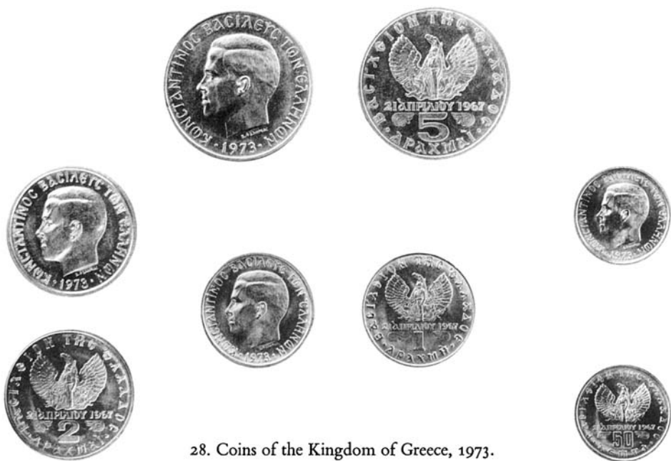
28. Coins of the Kingdom of Greece, 1973.

1862). The new monetary unit of the Kingdom of Greece was the drachma, a revival of the silver unit used in ancient times. The drachma was also divided into 100 lepta. Nine denominations were struck under Otho, ranging from a copper 1-lepton piece to a gold 20-drachma piece. Unlike the coinage of Capodistrias, the new royal coinage was produced in Munich, the capital of Bavaria, and in Paris. The three silver coins of Otho illustrated here (27) come from a hoard of 120 Greek coins found in 1952 in a green cloth bag between the stones of a modern wall. All bear the head of the youthful king on the obverse and the crowned royal arms on the reverse. The reverse dies also carry the denomination, the date, and the mint mark. In 1836 a new mint was established in Athens, but it was closed in 1858. From then until 1971, Greek coins were again struck abroad. The later Greek pieces turn up regularly in the excavations.