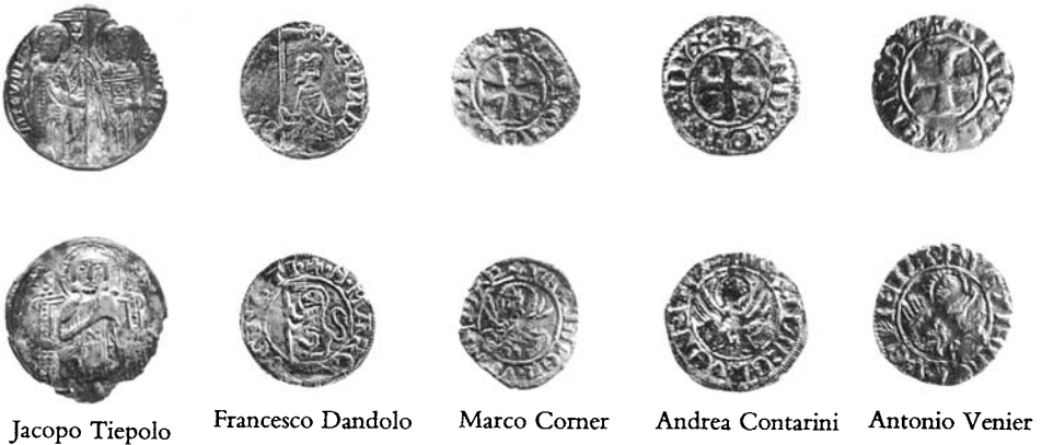
17. Venetian coins, 1229–1400.

The earliest Venetian coins found in the American excavations (17) are those of Doge Jacopo Tiepolo (1229–1249). One of his silver grossi, with the doge and St. Mark on the obverse and Christ enthroned on the reverse, is illustrated. Nevertheless, during the first 70 years of Latin rule in Greece, Venetian coins are rare in Athens, the monetary needs of the city having been met by old Byzantine coppers and new Frankish currency. A few dozen coins of Francesco Dandolo (1329–1339) and Marco Corner (1365–1367) have, however, been unearthed in the Agora, including the silver soldino of Dandolo and billon tornesello of Corner reproduced here. The civic emblem of