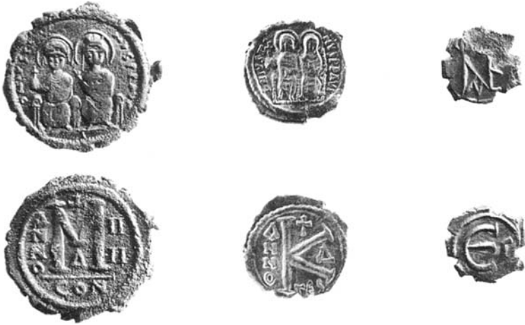
8. A follis, half-follis, and pentanummion of Justin II and Sophia.

Theoupolis (City of God), the name the Syrian city assumed after a great earthquake in 528. More mints were in operation under Justinian than at any other time in Byzantine history—a testimony to the extent of the emperor's military campaigns.