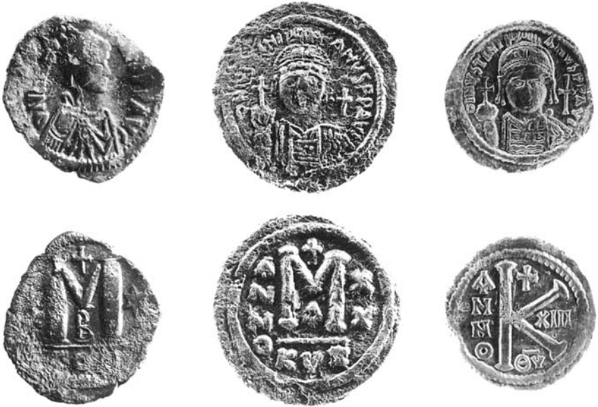
6. Copper coins of Anastasius and Justinian.