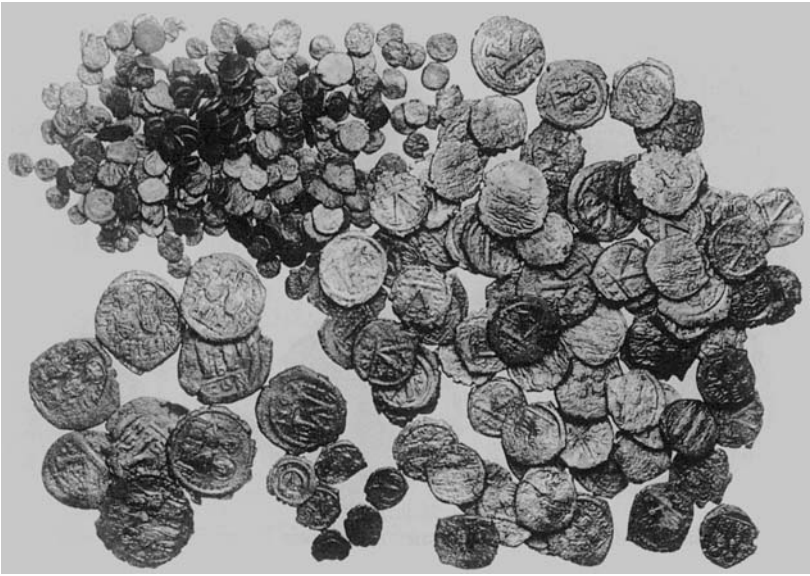
7. A hoard of Byzantine coins buried ca. A.D. 580.

early Byzantine coins are Greek, despite the obverse Latin legend and the use of Latin letters for the mint signature: M (40), K (20), I (10), € (5). The new denominations were called the follis, half-follis, dekanummion, and pentanummion respectively.