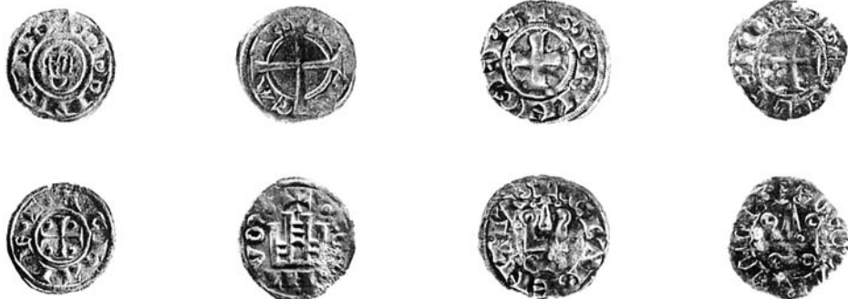
Guillaume II de Villehardouin