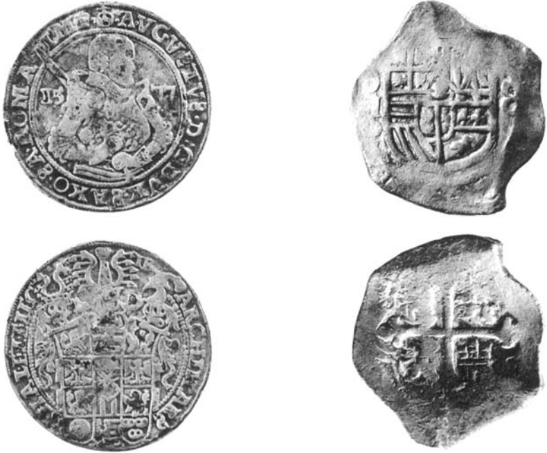
23. A Dresden taler and a Mexico City 8-real piece.