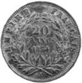
24. Coins of Louis XIV and Napoleon III of France.

a characteristically poorly struck specimen of Philip IV (1624–1665) with heraldic types, from Mexico City (23). The irregularly shaped 8-real pieces from the New World were struck on flans obtained by slicing silver bars and must have been regarded with suspicion by the few Athenians who encountered them.