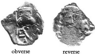
3. A 'countermarked' Byzantine coin. A small monogram was impressed upon a coin of Constans II (641-668) under Constantine IV (668-685) in order to devalue the coin.

The old method of producing coins by hammering was gradually supplanted in Europe from the 16th century on. Refinements in design over the centuries have resulted in machines capable of manufacturing thousands of coins per minute. In addition to increased speed of striking and the other obvious benefits derived from the replacement of human labor by machines, modern coining presses have three important advantages over the hammered method: the production of exactly circular blanks of uniform weight; the stamping of the blanks with clear, perfectly centered designs; and the marking of the edges of the coins with grooves or letters (or both) to insure against the reduction of a coin's metal content by filing. In the early 19th century machines were invented that permitted dies to be produced mechanically by reducing a metal cast of an artist's original large plaster model. Thus today an infinite number of identical dies, each capable of striking about 80,000 coins, can be made from a single model about ten inches in diameter.