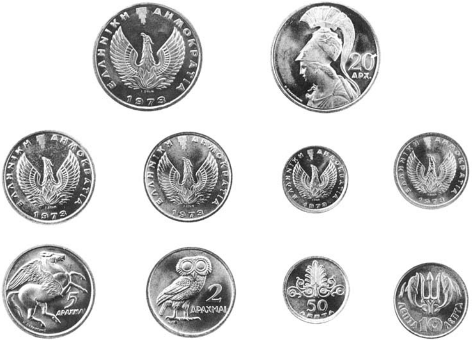
29. Coins of the Greek Republic, 1973.

seen major changes in the country’s government and these changes are recorded on the coinage.