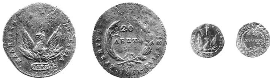
26. Greek coins of John Capodistrias, 1831.