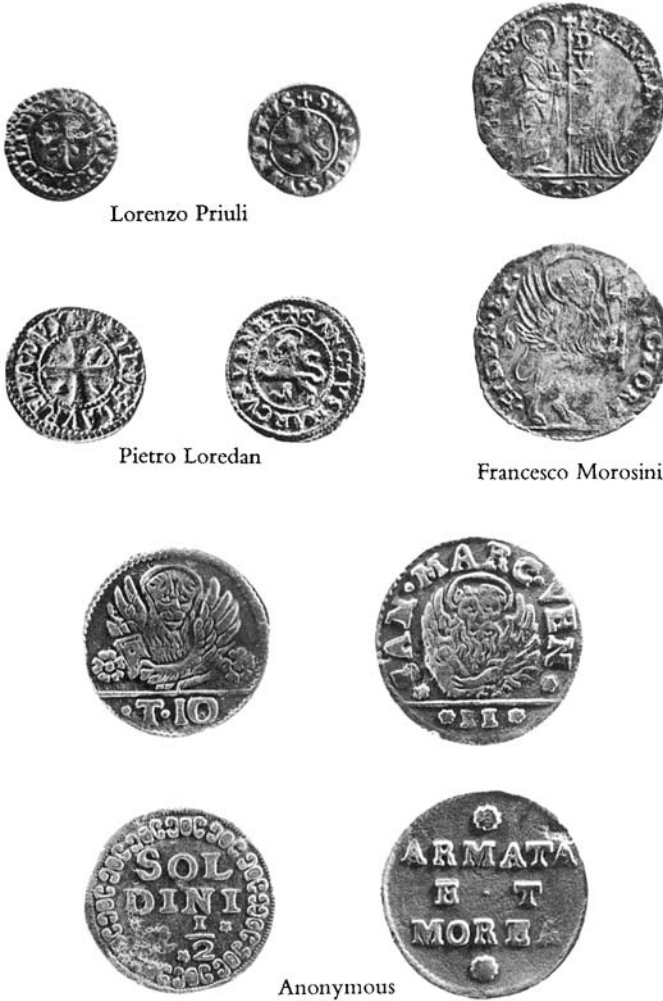
19. 16th- and 17th-century Venetian colonial issues.

and a billon 4-carzi piece of Pietro Loredan (1567–1570) struck for Cyprus during the time that island was under Venetian control (1489–1570). Also illustrated is a silver \frac{1}{8} -lion piece, for use in the Levant, of Francesco Morosini (1688–1694), infamous for causing an explosion in the Parthenon when he bombarded the Akropolis. A few hundred anonymous colonial copper issues have also turned up in the Agora, including a 10-torneso ( 2\frac{1}{2} -soldino) piece struck for use in Crete and a gazzetta intended for the Venetian fleet and the Morea.