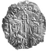
Basil I and Constantine