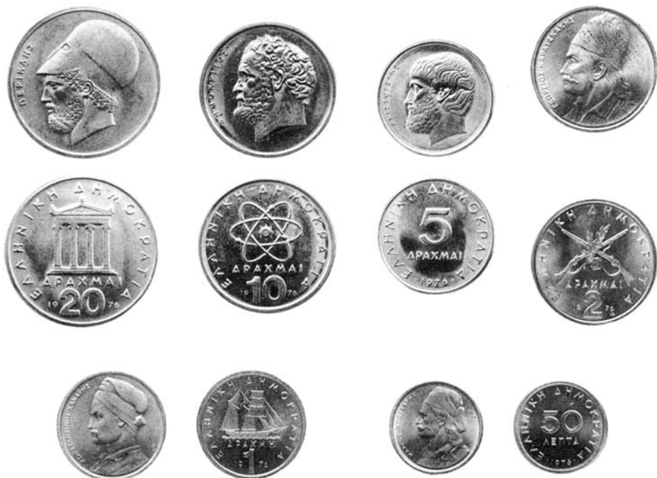
30. Coins of the Greek Republic, 1976.

Corinthian coin type), Athena's owl (used on ancient Athenian coins), ancient architectural ornament, and dolphins framing Poseidon's trident.