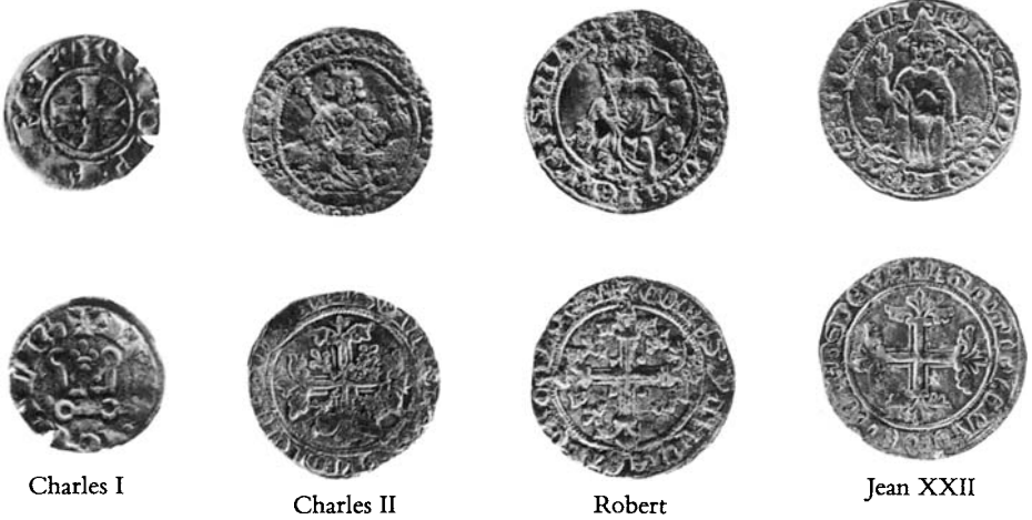
16. 13th- and 14th-century French coins.

decades of the rule of his nephew and successor, Guy I de la Roche (1225–1263), the petty currency used in Athens continued to be the 12th-century Byzantine coppers of the Comneni. Towards the middle of the 13th century, however, Guillaume II de Villehardouin, Prince of Achaia (1245–1278), and Guy I of Athens began to issue their own money. These new Frankish coins have been found in considerable numbers in the Agora excavations (14, 15). They were struck at first only in copper, but around 1267 Prince Guillaume II inaugurated the minting of new higher-denomination pieces in billon (an alloy of silver and copper) and about 13 years later Duke Guillaume I de la Roche (1280–1287) followed suit. Three mints were employed by the Franks for the manufacture of billon and copper coins during this period—Corinth and Clarentzia in the Peloponnesos and Thebes in Boiotia.