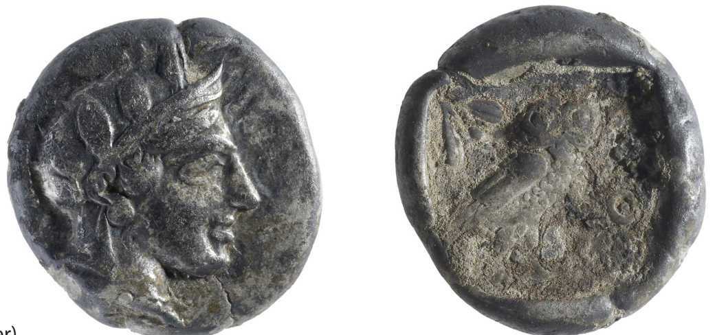
Fig. 5 - (ca. 1.5 cm. diameter)