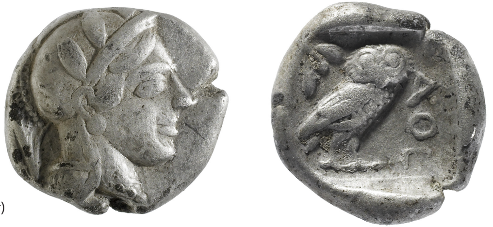
Fig. 4 - (ca. 1.47 cm. diameter)